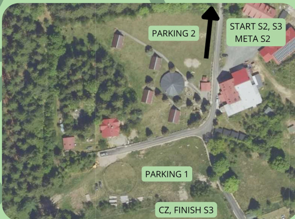
STAGE 2,3 ^